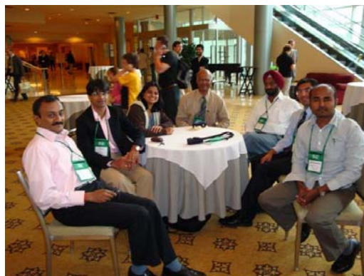
Indian Weed Scientist at IWSSC Vancouver