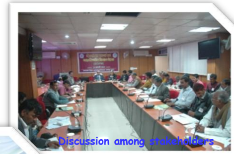
Discussion among stakeholders