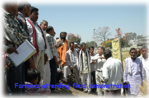
Farmers attending field demonstration

On the occasion of Kisan Mela, a simultaneous session on interface meeting between