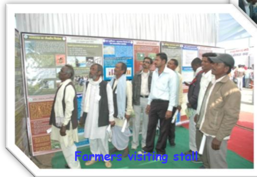
Farmers visiting stall